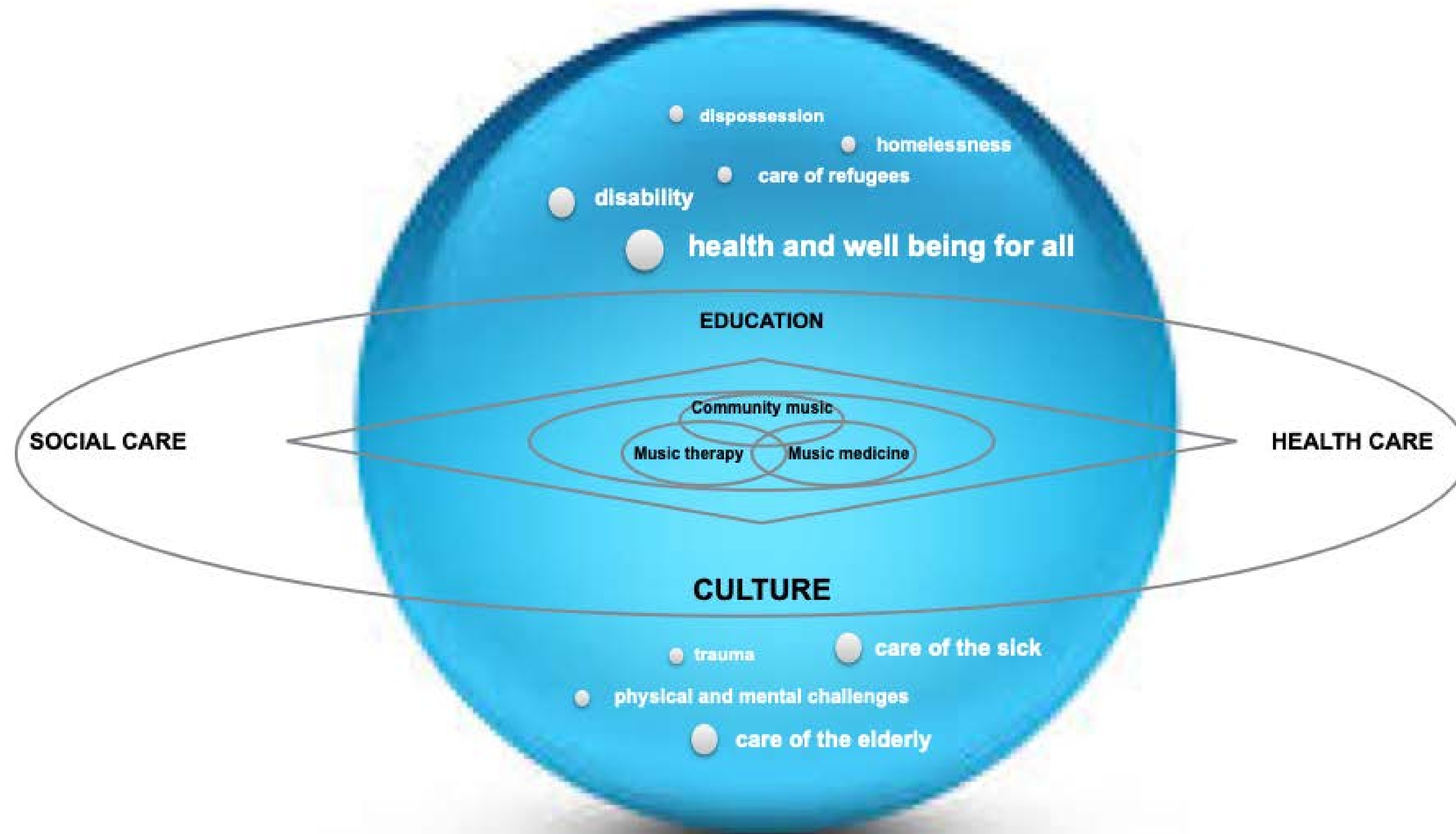
Osborne-Ritchie Model, 2019